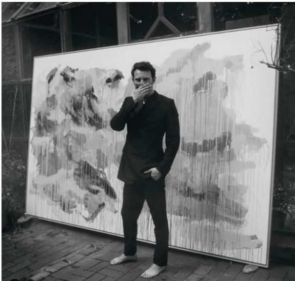
Portrait Paul Schrader