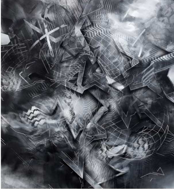
Remnants of Formation

Spraypaint, acrylic and markers on canvas