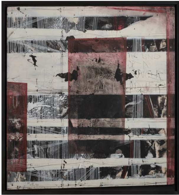
The end of a Superpower

Lino printing color, acrylic paint, spraypaint, oil pastels, marker, marker fluid, polychromos pens and dirt on wood.